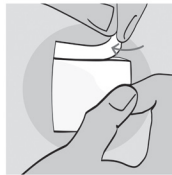
Figure 1: Opening the sachet.

Tear across the sachet to open and unfold the wipe inside (Figure 1); do not use any tool to open the sachet.