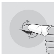
Figure 2: Cleansing your eyelids and eyelashes.

Gently massage with small circular movements, removing any crusts, secretions or make-up.