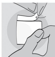
Figure 1: Opening the sachet.

Tear across the sachet to open and unfold the wipe inside (Figure 1); do not use any tool to open the sachet.