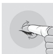
Figure 2: Cleansing your eyelids and eyelashes.

Wrap the wipe around the top of your index finger. Keeping your eye closed, carefully place the wipe on your eyelids and the base of your eyelashes (Figure 2). Gently massage with small circular movements, removing any crusts, secretions or make- up.